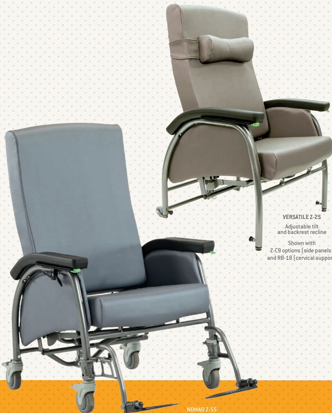
VERSATILE Z-25 Adjustable tilt and backrest recline Shown with Z-C9 options (side panels) and RB-18 (cervical support)