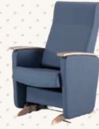
THERA-GLIDE® OASIS ROCKING