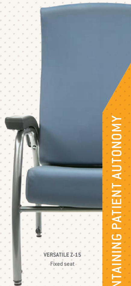
VERSATILE Z-15 Fixed seat